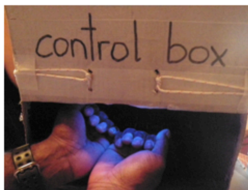
Glo-germ Activity Instructions: Hygiene Promotion Box

Source Link: https://watsanmissionassistant.org/?mdocs-file=10108